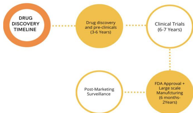
Figure 3 Drug Discovery Timeline